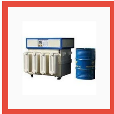
Three Phase Servo Stabilizer