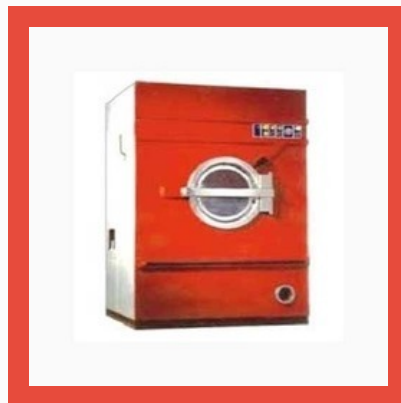
MTO Dry Cleaning Machines