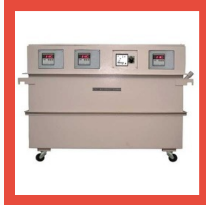
Oil Cooled Servo Stabilizer