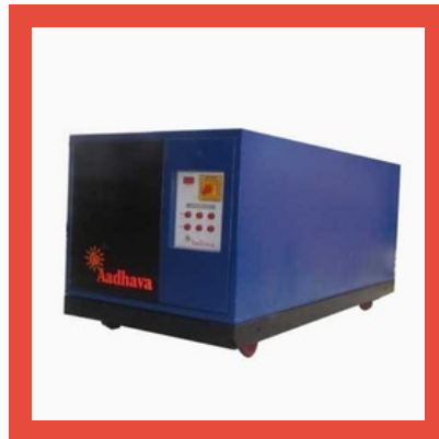
Oil Cooled Servo Stabilizer