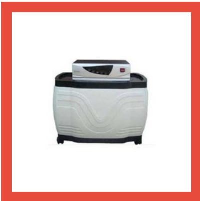
Domestic UPS System