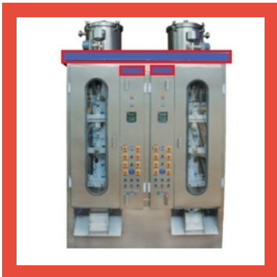
Mechanical Normal Speed Pouch Packing Machines