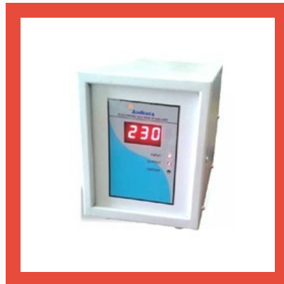
Digital Servo Stabilizer