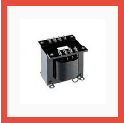
Step Down Transformer