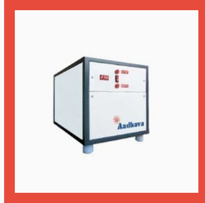
Single Phase Voltage Stabilizer