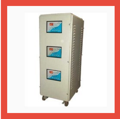
Digital Voltage Stabilizer