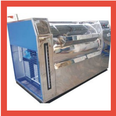
Industrial Washing Machine