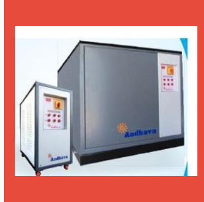
Oil Cool Servo Stabilizer