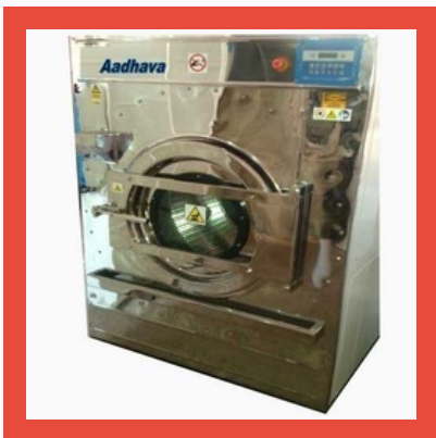
Front Load Wash Machine