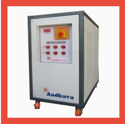
API Sleek Servo Stabilizer