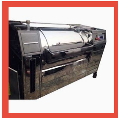
Laundry Washing Machine