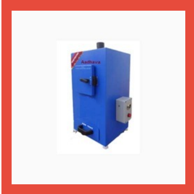
Sanitary Napkin Incinerator