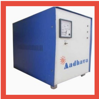
1 Phase Servo Stabilizer