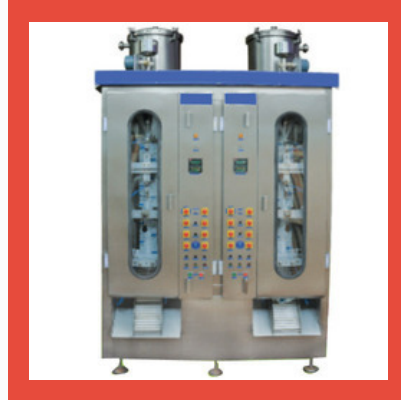
Milk and Liquid Packing Machines