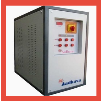
Air Cooled Servo Stabilizer