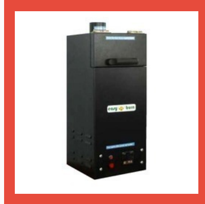
Sanitary Napkin Destroyer