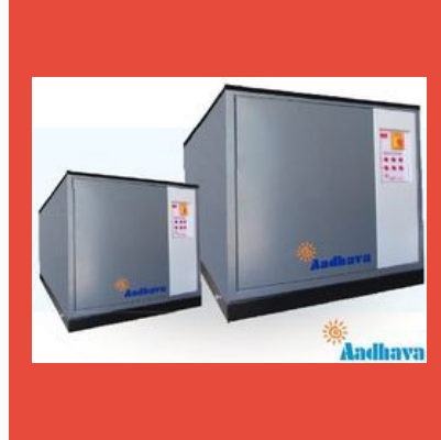
Oil Cooled 3 Phase Servo Stabilizer