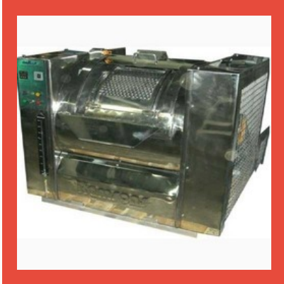
Commercial Washing Machines