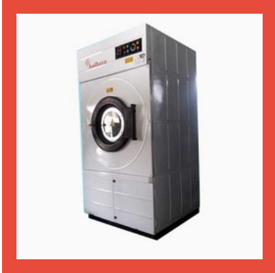
Industrial Tumble Drier