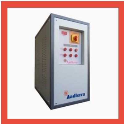
Power Saver and Servo Stabiliser