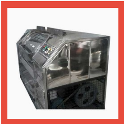
Industrial Laundry Machine