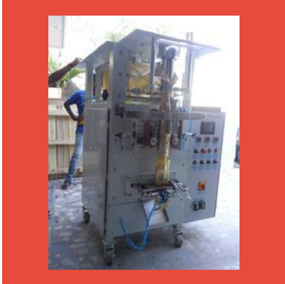
Automatic Pouch Packing Machines