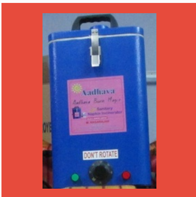
Napkin Destroyer Sanitary Napkin Incinerator