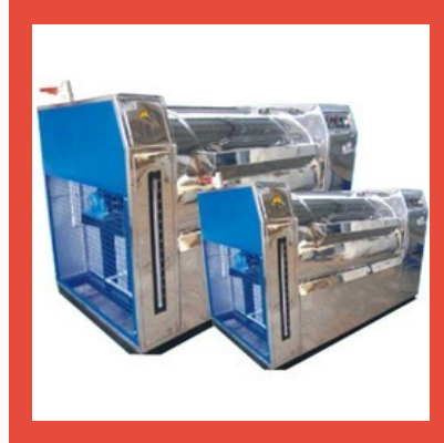
Commercial Washing Machine