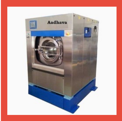
Industrial Laundry Machine